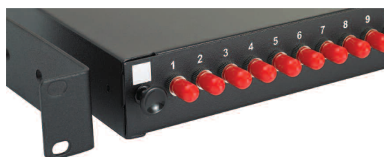
C. Adjustable fixing arms. clear port and panel labelling